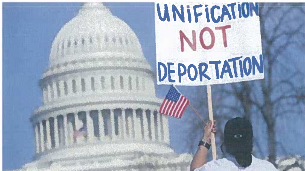
Pro-immigrant demonstrators hold a sign during a demonstration in Washington, DC, in April 2014.