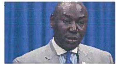
Benjamin Crump, Attorney