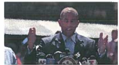
Hakeem Jeffries, US Congressman